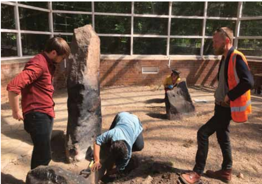
ABOVE Orbis Conservation work to remove Stone F, the smallest of the Calder stones. Unlike its neighbours, this stone was set in concrete; the conservators have decided not to remove this, to avoid damaging the stone.

Stepping inside an unassuming unit on a Greenwich business park, I found myself surrounded by giants. These towering, brightly coloured forms were, in fact, 19th-century ships' figureheads, loaned to Orbis Conservation by the National Museum of the Royal Navy for expert restoration. It was another, equally monumental project that I had come to find out about, though.