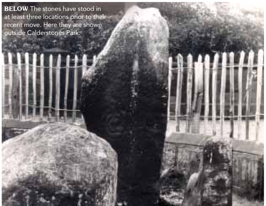
BELOW The stones have stood in at least three locations prior to their recent move. Here they are shown outside Calderstones Park.

The stones will be set in new silicone sockets with stainless-steel bracketing and dry sand packing. This stands in contrast to their previous set-up, where most had been packed with bricks. The smallest stone (Stone F), though, was set in concrete – possibly to allow more of